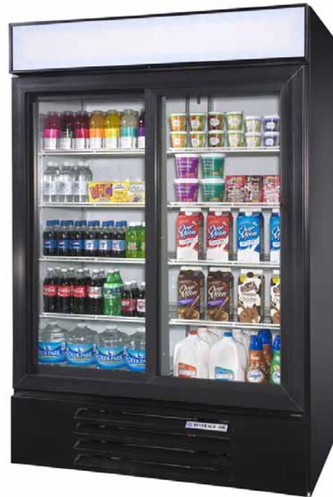
LV45 (shown with 4 shelves per section)